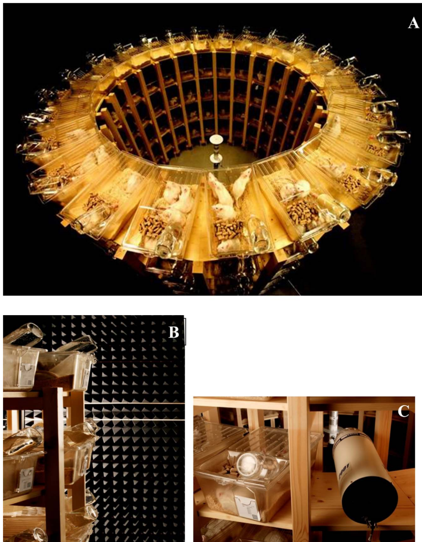
Fig. 1. RI study on 1.8 GHz base station RFR: exposure system. The rat cages were located in wooden circular-shaped devices, as in a sort of condominium. Each single exposure device served at least 400 rats (A). The exposure rooms were totally shielded in order to minimize the effect of field non-uniformity due to reflection and consequent interference caused by the walls (B). Detail of the RFR feedback probe used to measure the field (TESY2001 field sensor) and of the animal cage with methacrylate markers, cover and mangers (C).

produce the following functions: a) generate a GSM signal, with complete channel simulation capability and frequency preselection; b) signal pre – amplifications – age, with gain regulation input; c) final stage, dimensioned for a total power output of plus 50 dBm; d) reference signal loop back input, for closed loops power control; the control was closed at the antenna connection level in order to stabilize at the maximum level the radiation unit RF feed; e) power supply unit; f) cooling unit for continuous use of the device.